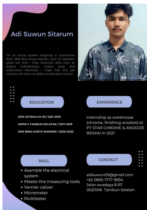
Figure 3. Adi Suwun’s CV

The following analysis can be seen from Figure 3.