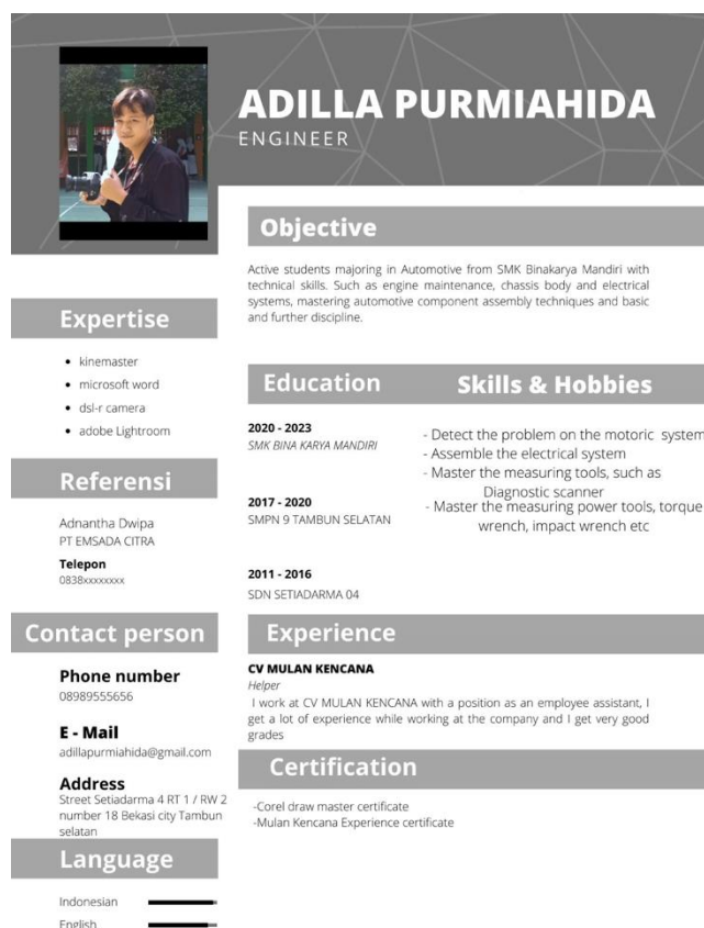
Figure 4. Adilla's CV

The last observation is taken from Figure 4.