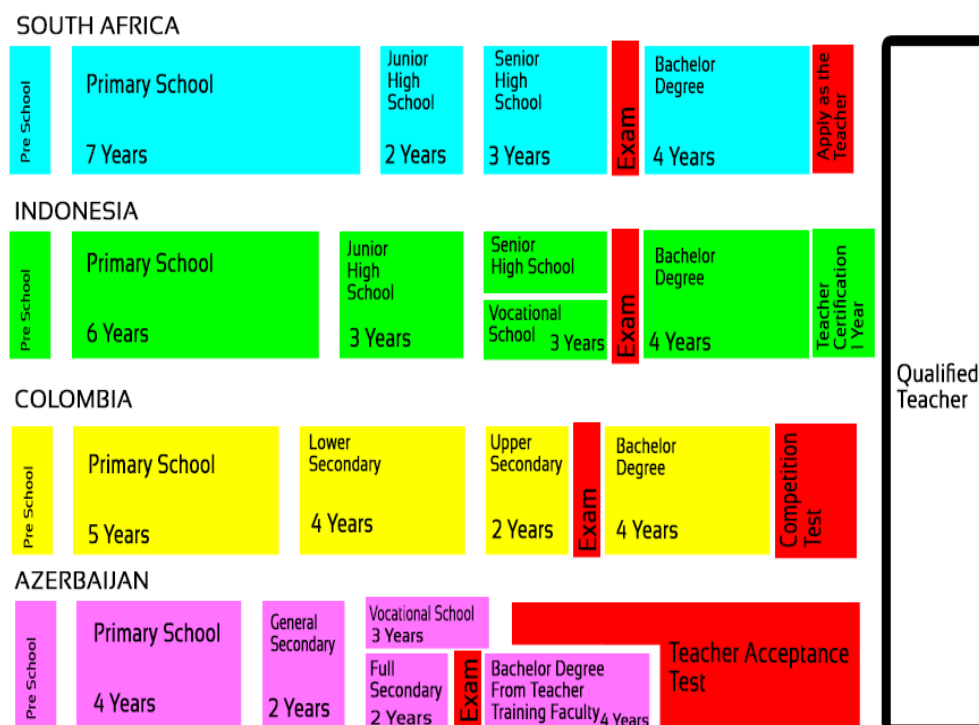
Figure 1. Steps to be qualified teachers in South Africa, Indonesia, Colombia and Azerbaijan

The discussion starts from comparing the step of teacher qualification in Indonesia, Azerbaijan, Colombia and South Africa. The data source based on department of education in each country. The group of author comes from each country so that the data more easy to collect and get the meaning of government document. These selected countries differed in the procedures and degrees of education needed to become teachers (Figure 1). (data from Minister of Education of each country).